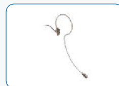
DWS-MC61B Single-Sided Uni- Directional Ear worn Microphone