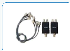
DWS-AD50F Passive Antenna Divider Pack