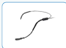
DWS-MC77 Uni-Directional Headset Microphone