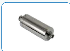
DWS-AB80 UHF Antenna Booster