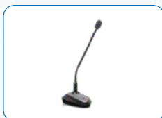
DWS-83 Wireless Gooseneck Microphone