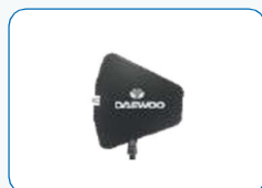
DWS-DA80 Wideband Directional Antenna