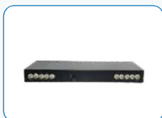
DWS-AD85 Wideband 4-Channel Antenna Divider