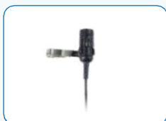
DWS-MC16+ Uni-Directional Lavalier Microphone