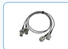
DWS-FM801 Rear-to-Front Cables