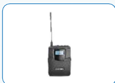
DWS-82 Rechargeable Backpack Microphone