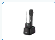
DWS-HC92 Dual-Slot Charging Station