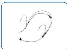
DWS-MC201 Dual-Sided Uni-Directional Waterproof Head worn Microphone